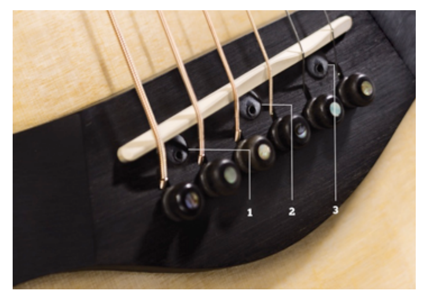
Image 1.3 Bridge with three Allen screws indicating it has an ES2 battery box