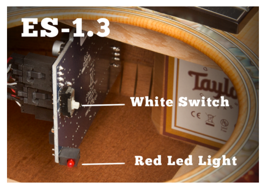
Image 1.6 Locating the red LED light & single white switch on an ES-1.3 preamp board

- In Image 1.6 immediately below, the small red LED light is positioned on the lower right side of the circuit board, and there is a single white switch on the same side, above the red LED light. (Reference Image 1.6 immediately below)