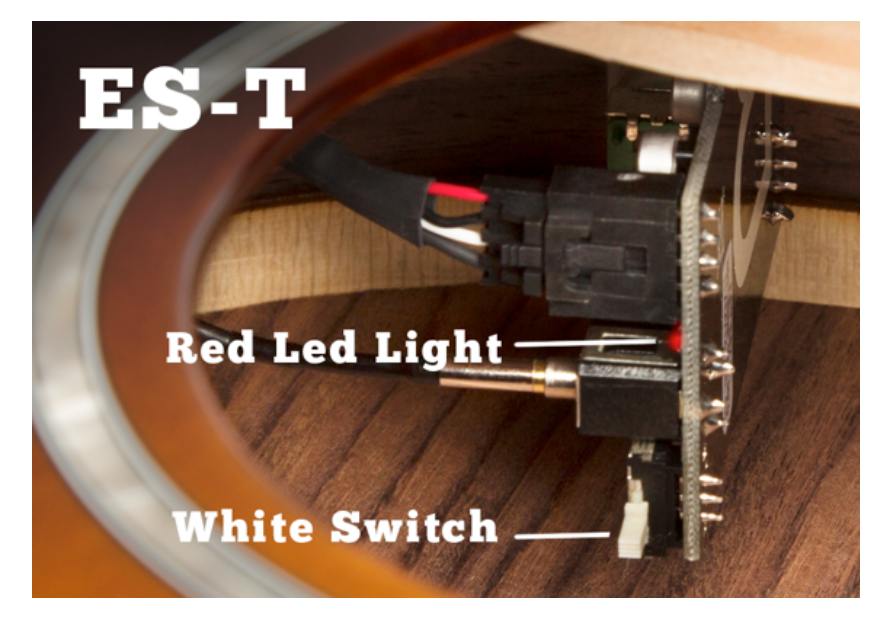
Image 1.5 Locating the red LED light & single white switch on an ES-T preamp circuit board

- In Image 1.5 immediately below, the small red LED light is in the middle left side of the circuit board, and there is a single small white switch on the same side of the board, just below the red LED light. (Reference Image 1.5 immediately below)